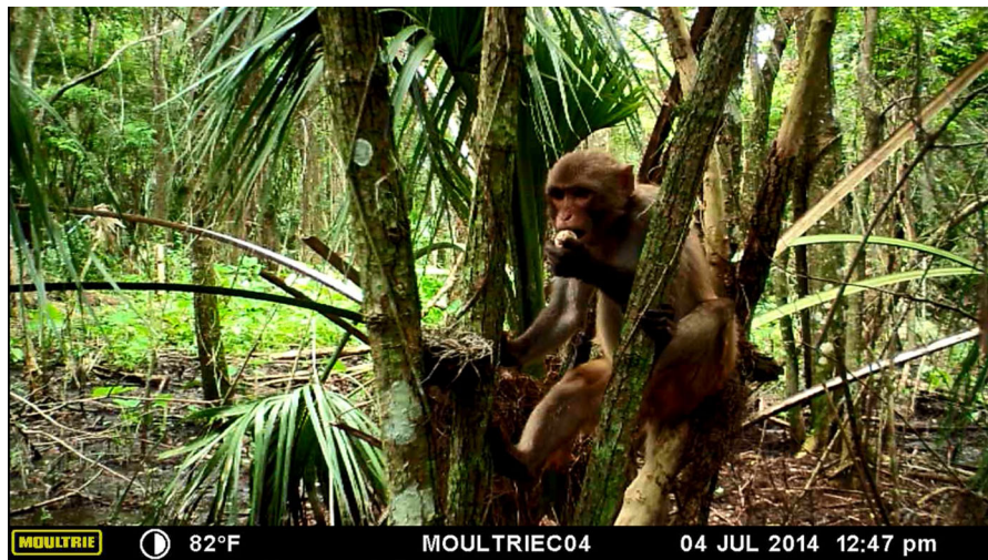
Fig. 2 Image captured by a camera trap of a rhesus macaque consuming a quail egg from an artificial nest